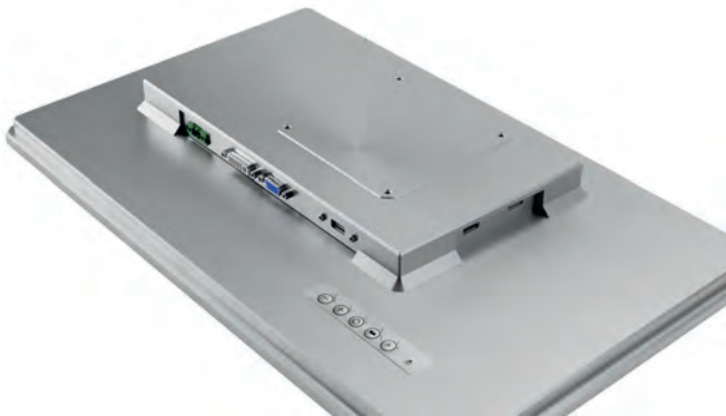
Industrial Touch Monitor