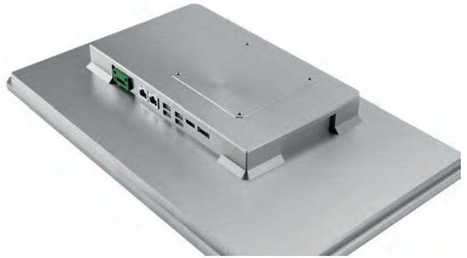
Industrial Panel PC