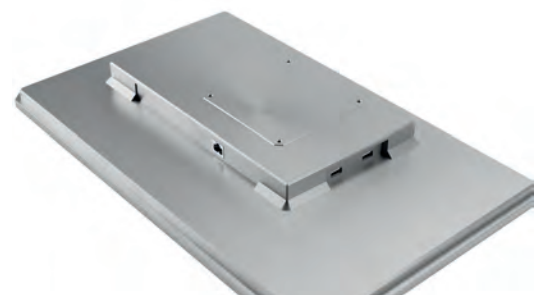
HDBaseT Touch Monitor